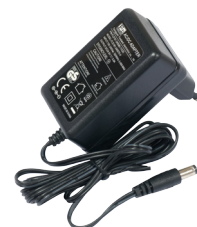
24V 0.8A Power adapter